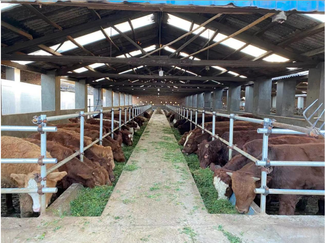
图三 云南国际肉牛交易中心规划图 Picture 3 Planning of Yunnan International Beef Cattle Trading Center

云南国际肉牛交易中心概念性规划 Conceptual planning of Yunnan international beef cattle trading center